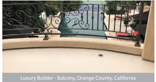
Luxury Builder - Balcony, Orange County, California