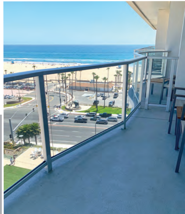
Luxury Hotel - Balcony Deck, Orange County, California