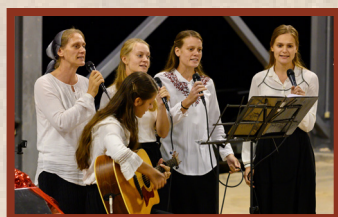
Spies Family Singers