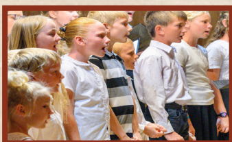
Cayo Children's Choir