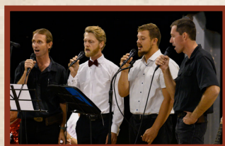
One Accord Men's Quartet