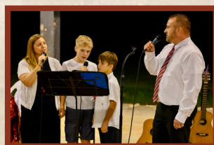
Lang Family Singers