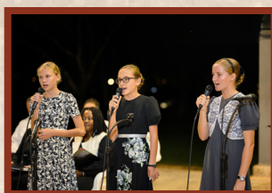
Jubilant Girl's Trio