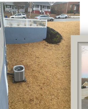
Above: A side view of LL1 from the landscaped driveway of LL2.