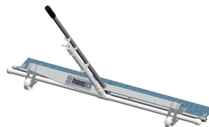
Ready for Use (As Assembled)