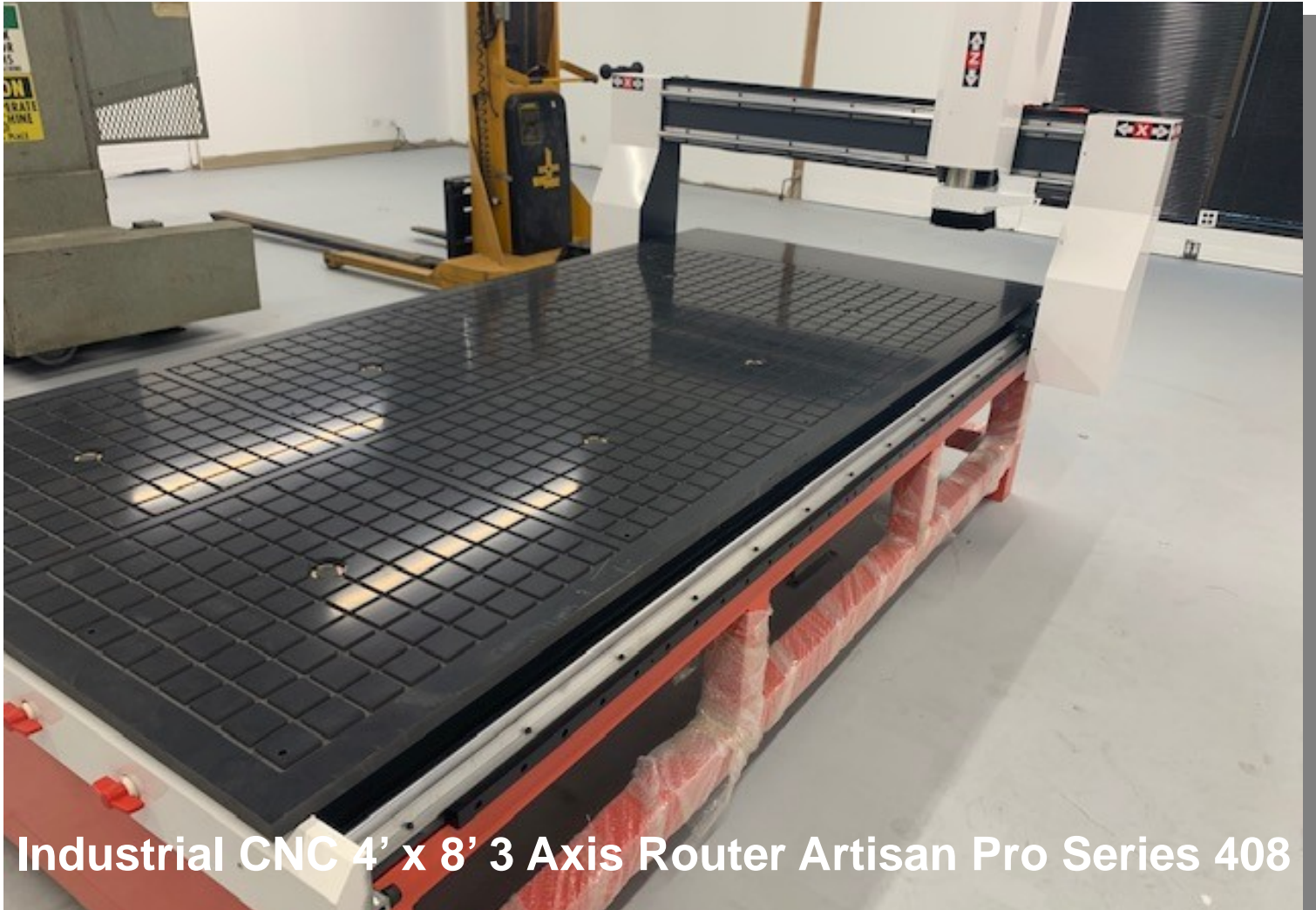
Industrial CNC 4' x 8' 3 Axis Router Artisan Pro Series 408