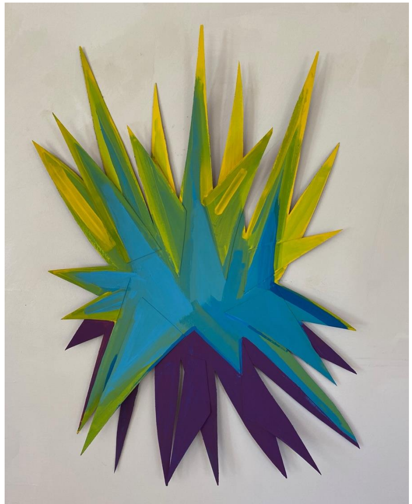
"The Fat Yucca," the blue and green shape exploding open, felt like a wide leaf yucca coming back alive after the long freeze and good snow

This aspect of play and encouraging experimentation was also central to her long career teaching elementary art to Zuni and Navajo communities in New Mexico.