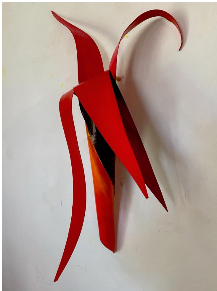
"Pink Lipstick Flower". It is of these red flowers I see on the trail on a long stem looking lively, with these vey linear petals.

Her upcoming show, “ Ode to a Zuni Mountain Spring ”, is the product of this experimentation, paired with the inspiring imagery of landscapes, space and organic structure of the Zuni Mountain land on which she currently resides. Spending time on her long walks, feeling into the textures of the wildflowers, the canyons and even the water runoff through a certain spring fed cave, Rachel’s works are representative, sculptural, tactile and give you a very felt, albeit abstracted, representation of the flowers and geology on the land that she calls home.