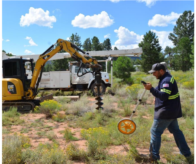
MAG ELECTRIC of Grants and Continental Divide Electric Coop donated their time, materials, and hard work. A GoFundme account was set up for remaining installation costs and received $2700 in private donations.