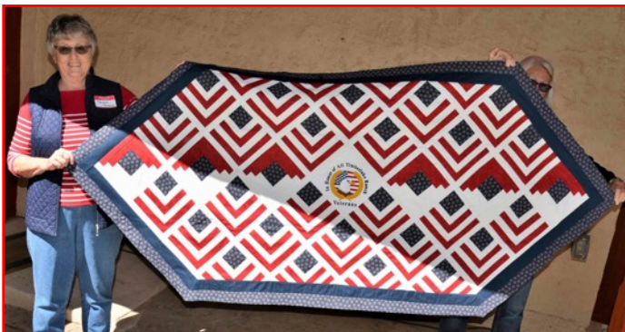
Our beautiful Patriotic Quilt

Thank You For Your Service Timberlake Veterans!