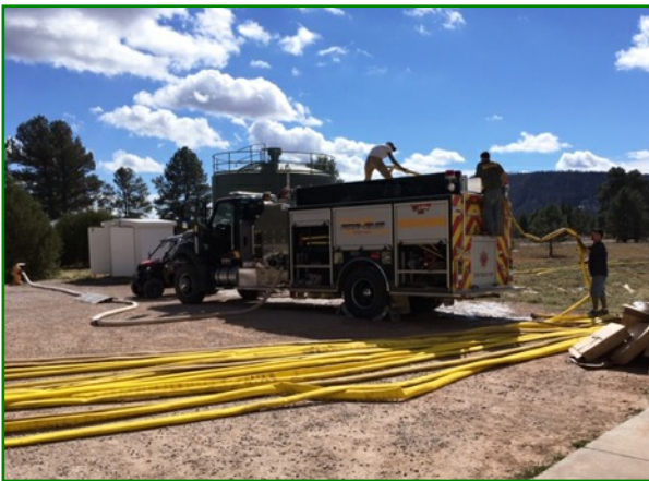
Department received twenty new "sticks" (hose sections)

Here are some pictures of our firefighters in action. Not only do they respond to emergencies in the area, they are constantly training to improve their techniques. When you see them, please tell them that they are appreciated.