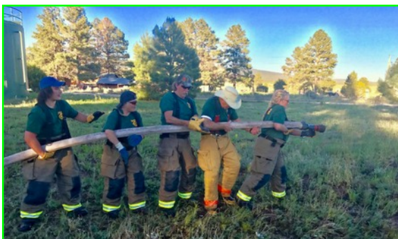
Hose training 2018

Here are some pictures of our firefighters in action. Not only do they respond to emergencies in the area, they are constantly training to improve their techniques. When you see them, please tell them that they are appreciated.