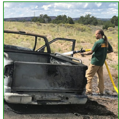
Car fire on Hwy. 53

Ramah/Timberlake Fire/Rescue PO Box 631 Ramah, New Mexico 87321 505.783.4221 or 911