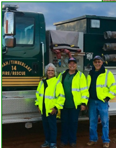
Presence at the Mystic Bluffs Fly-In