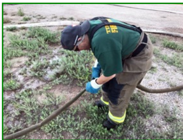
Hose training 2018