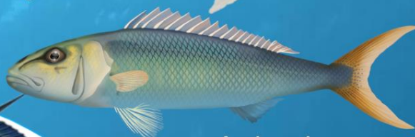
Aprion virescens Valenciennes