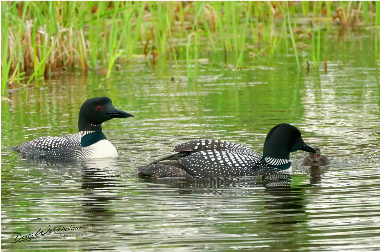
Loon feeding Chick - 19 June 2021

Bob Wynes and I were able to do 14 complete counts of all the loons on the lake between 19 June and 21 September 2021. Three of these we did together, while the others were completed separately, often with guest spotters aboard. Our first spotting of loon chicks was on 19 June, about the same time as last year.