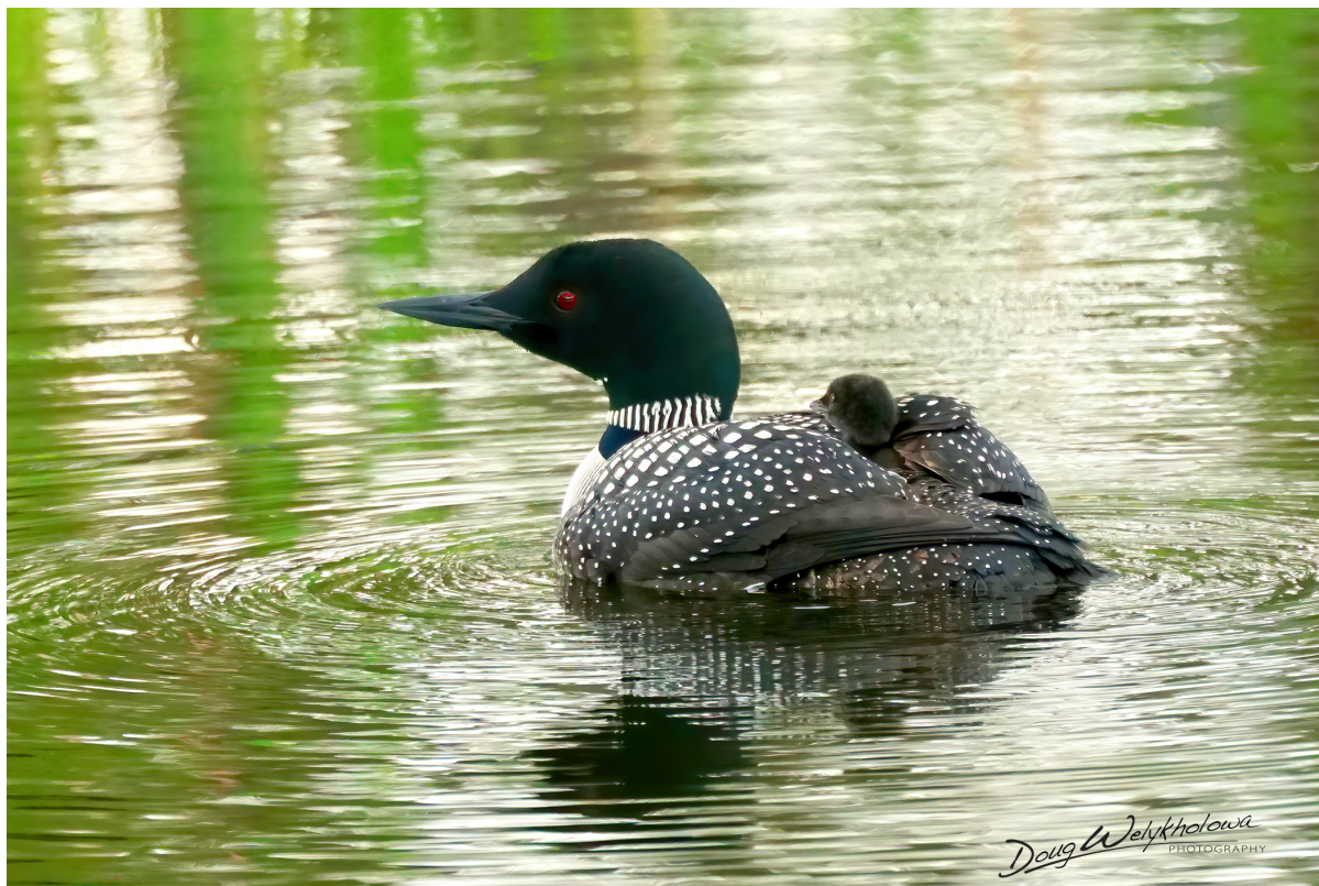
Loon with Chick on back (2nd Chick under left wing) - 19 June 2021

A total of 23 nesting territories were noted this year. This is a drop of 3 territories from 2020. 4 territories were abandoned, and an old territory that was last occupied in 2018 was re-established (See Figures 1 & 2 below for comparison).