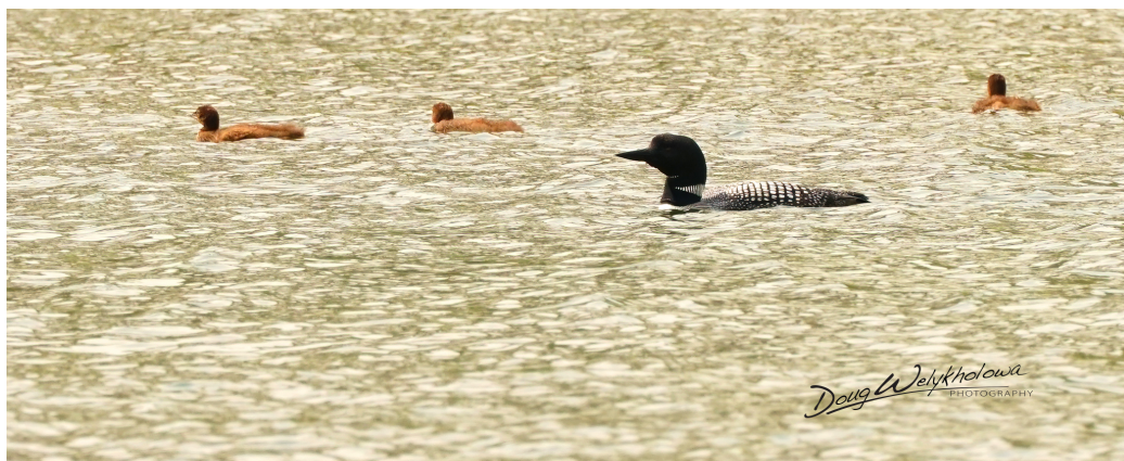
Loon with 3 Chicks near West end of Miles Island - 14 July 2021

The highlight of this year's count was our finding one pair of adults with a brood of 4 chicks. Although all 4 chicks appeared to be the same age, we don't know if they all were from the same parents. We initially spotted 3, followed by 4 a week later, however, based on the location, one chick may have been hiding in the reeds on the initial sighting. The 4 chicks all survived to 7 weeks, after which only 3 were present for the remaining counts. We didn't find the nest, as the cove where it is likely located isn't accessible by power boat, and it is about a 5 km paddle by kayak. There is a possibility that one or two of the chicks were adopted from an adjacent territory. Kathy Jones, the Canadian Lakes Loon Survey Volunteer Coordinator at Birds Canada noted that this is only the 10th such sighting of a 4 chick brood in 40 years of data collection across North America. Needless to say, we were very excited to have observed this rare event.