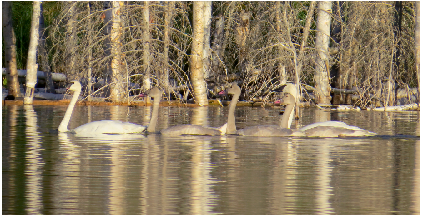
Trumpeter Swans with 3 Cygnets - Pelly Bay - 22 September 2021