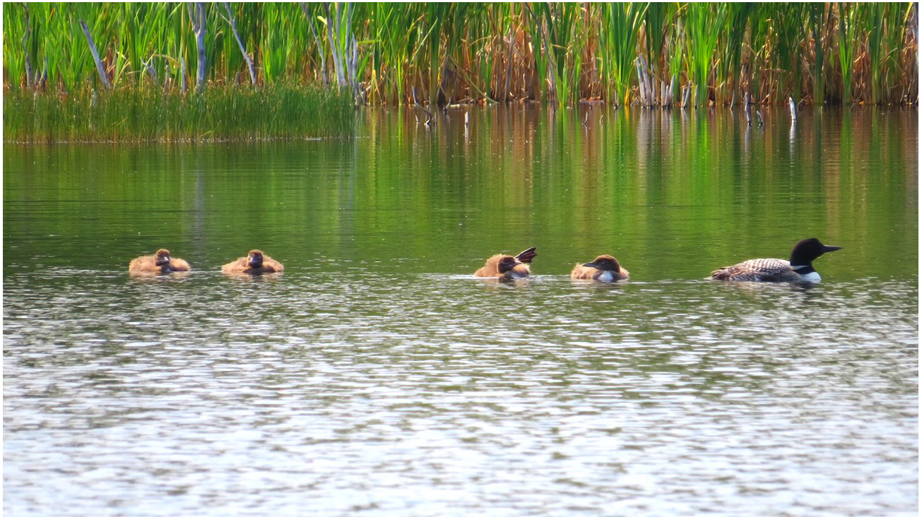
Loon with 4 chicks at Miles Island - 26 July 2021

Comparing data over the last 11 years ( Figure 3 ), the adult loon population has been very stable. The year-to-year variation is likely due to inaccuracies in counting the unpaired adults. As in previous years, the lake played host to a large number of unpaired young adults (3-5 year olds). These loons were often spotted in different locations on the lake with each count, and group size varied from 10 to 34 birds, depending on the day. It is quite common for these young adults to gather in larger groups in the middle of the lake during the evening, while dispersing during the day to feed in other locations, including the many nearby kettle lakes surrounding Madge.