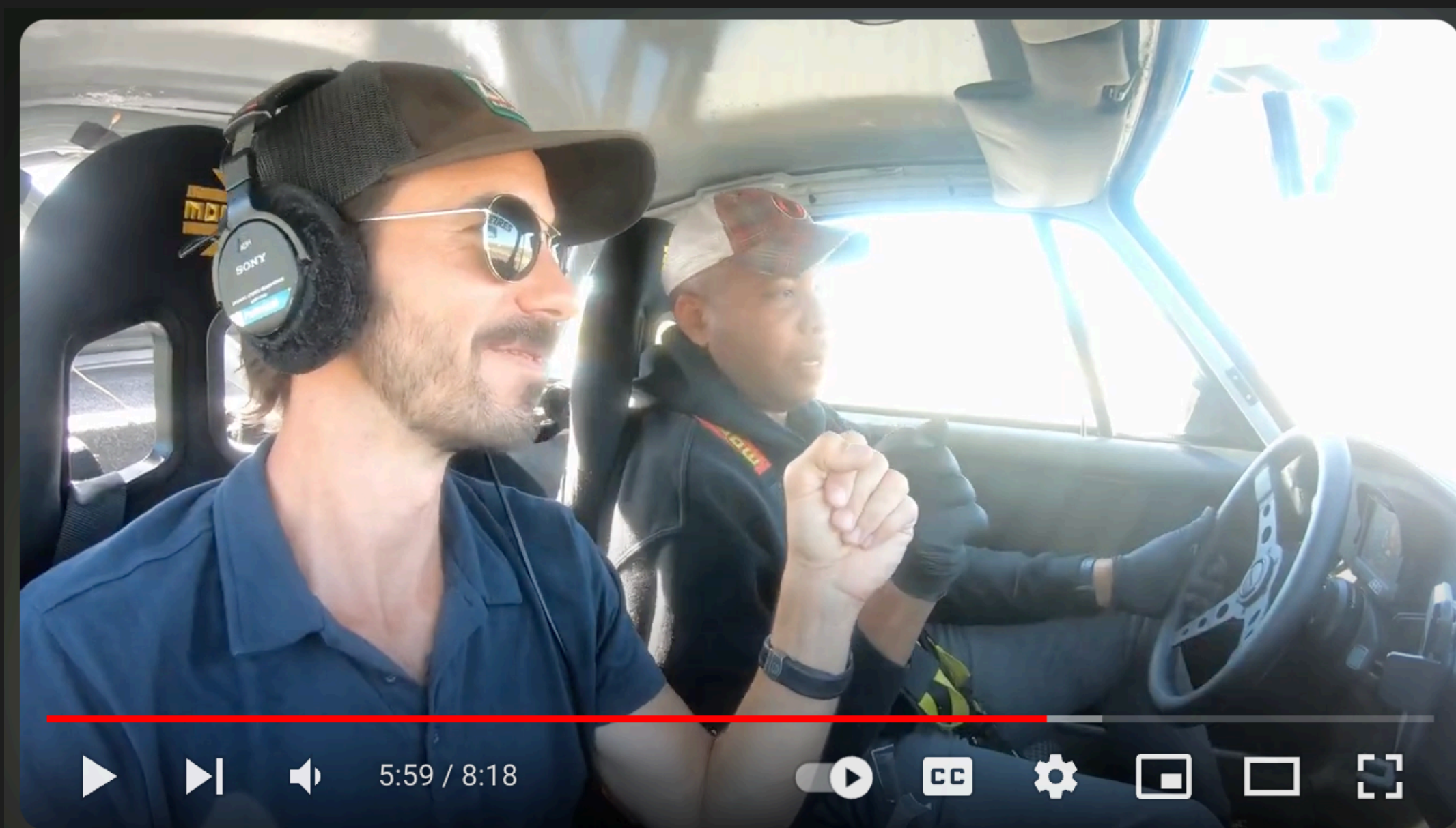
Vision of Sound - Ep 1 (Electric Car)