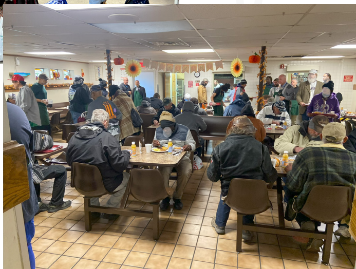
Our Community Meal Guests