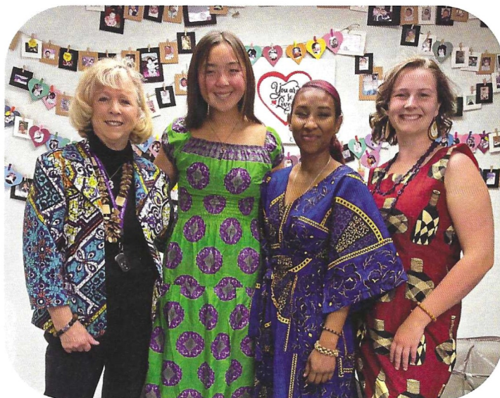
Note: Birthright staff gathered for Annunciation Baby Shower.

A key aspect of Birthright is that we are completely dependent on donations – both monetary and material. We rely on the community as much as the moms rely on us for support! The generosity of our donors enables us to be generous. Providentially, it often seems that when we are in short supply of something we receive an unexpected donation! We need many different supplies to support the women and babies who come through our door, including maternity and baby clothing, hygiene products, diapers, and formula. We are especially blessed each year by the abundance of gifts given to us in “Baby Showers” and “Baby Bottle” campaigns sponsored by local churches and Knights of Columbus councils. One particularly memorable event was the Baby Shower Brunch sponsored by the Archbishop Lamy Knights of Columbus council at Queen of Heaven Catholic Church. The new Grand Knight of this council cooked an overabundant breakfast for those attending. Another very memorable and productive event was the Baby Shower sponsored by the Women’s Guild at Our Lady of the Annunciation Catholic Church. Several of our staff modeled dresses made by mothers in the “Courageous Living” program at Birthright of Ghana (see the article in this newsletter about this inspiring Birthright chapter). One of these volunteers, who had previously been one of our clients, told the Guild members of the unbelievable challenges that she had overcome.