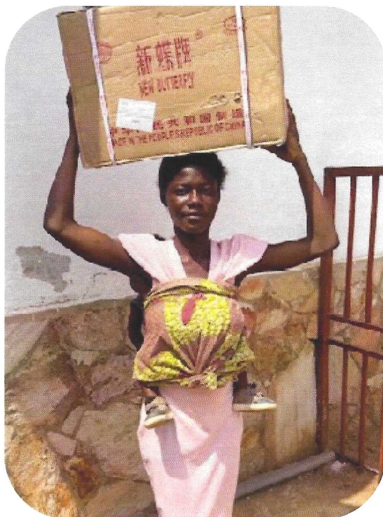
Note: This mom displays her new sewing machine sponsored by Courageous Living.