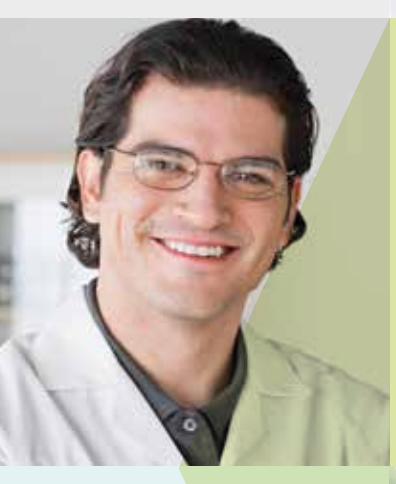
NUCLEAR MEDICINE PHYSICIANS