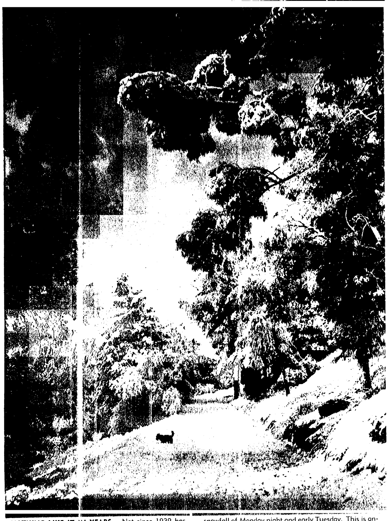
NOTHING LIKE IT IN YEARS—Not since 1932 has snowfall of Monday night and early Tuesday. This is another California received anything comparable to other beautiful scene—picture taken in Elysian Park.