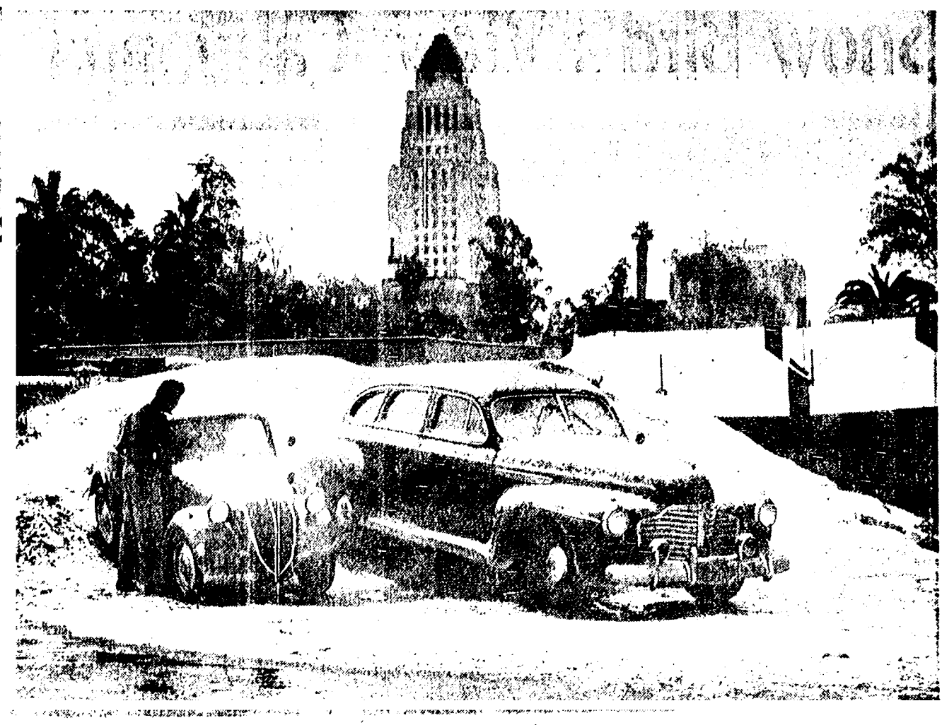
METROPOLITAN AREA—Downtown Los Angeles didn't get the snow that fell in outlying areas. Still, there