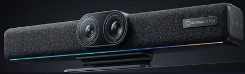
TELFOLINK AI VIDEO Bar - TEL 360