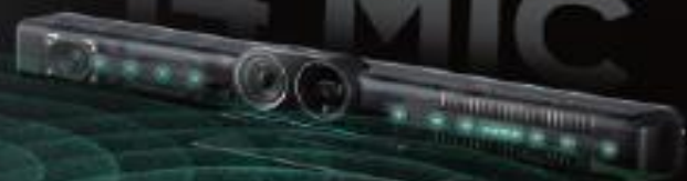
14 Mic Array