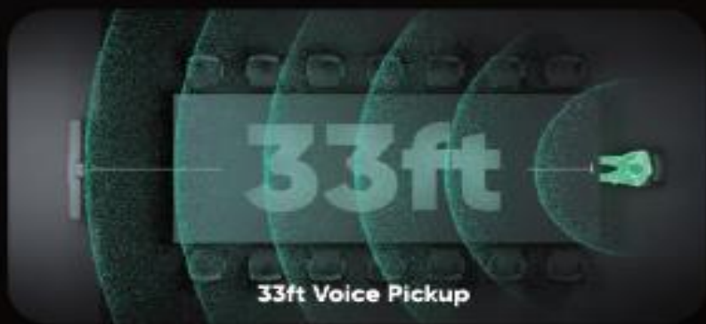
33ft Voice Pickup