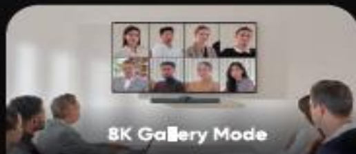
8K Gallery Mode