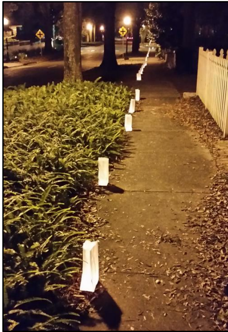
Thanks to the volunteers who helped put out, light, and pick up the annual sidewalk luminaries.