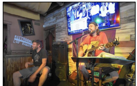
Orlando Sentinel: Nighttime entertainment at places like Wildside BBQ & Grille in Thornton Park