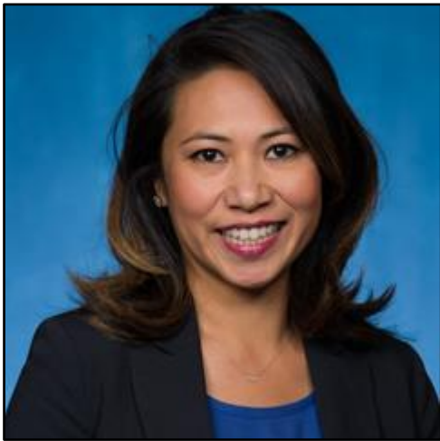
U.S. Congresswoman (7 th District) Stephanie Murphy

Stephanie Murphy was recently elected to the US House of Representatives from Florida's Seventh Congressional District, which was redistricted by a court order in 2015, and now includes Seminole County and northern Orange County. She currently serves on the House Armed Services Committee and the House Small Business Committee, where she serves as Ranking Member on the Subcommittee on Contracting and Workforce. Previously, the Democrat was a businesswoman and college instructor after serving as a national security specialist in the Office of the U.S. Secretary of Defense where she received numerous awards, including the Secretary of Defense Medal for Exceptional Civilian Service. She worked on a wide range of security issues from counter-terrorism to foreign military relations to strategic planning for the department. Prior to her public service, Stephanie was a strategy consultant at Deloitte Consulting. About Thornton Park, Ms. Murphy says, "It's an honor to represent the beautiful Thornton Park neighborhood and its residents in Congress. I'm proud to work every day to help our small businesses grow and to keep our community safe and vibrant." Congresswoman Murphy holds an M.S. in Foreign Service from Georgetown University and a B.A. in Economics from the College of William and Mary. She lives in Winter Park with her husband and two young children.