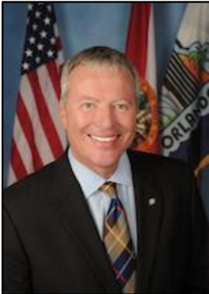
Orlando Mayor Buddy Dyer