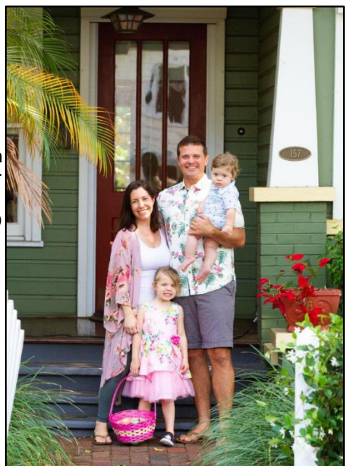
The Blake family recently moved into Thornton Park on Pine Street

app under Thornton Park. The committee will probably do another round of welcomes in about four months.