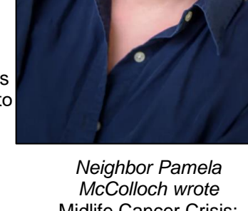
Midlife Cancer Crisis: A Memoir