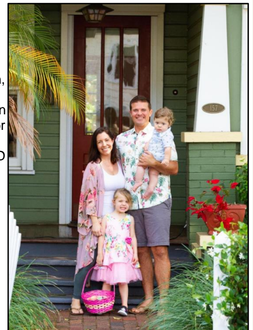
The Blake family recently moved into Thornton Park on Pine Street

The committee will probably do another round of welcomes in about four months.