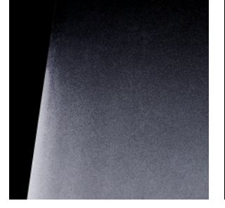
Mist - W : Center gradation Mist - S : Single gradation Mist - PR : Single gradation

Our popular Gradation Series works harmoniously with its setting to maximize available light. A space where light is not only welcomed by the use of FASARA<sup>TM</sup> Glass Finishes, but encouraged, it delivers a true holistic harmony with nature. Ensuring privacy is kept without creating a sense of closure. With a variety of configurations to capture your privacy and design needs, the new range of patterns deliver simple elegance while enhancing space and natural light into your built environment.