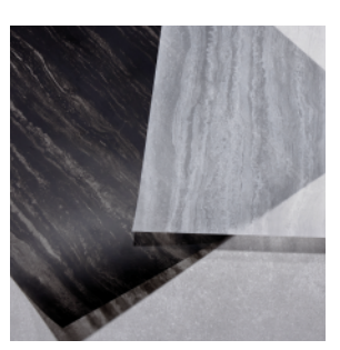
Travertine - White Travertine - Black