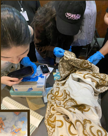
Inspecting a 79 year old Tunica' (vestment) white and the 'Manto' (cape), a 75 year old blue silk.