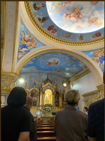
Grand tour of the museum and of the Pasig Cathedral also known as the Immaculate Conception Cathedral of Pasig