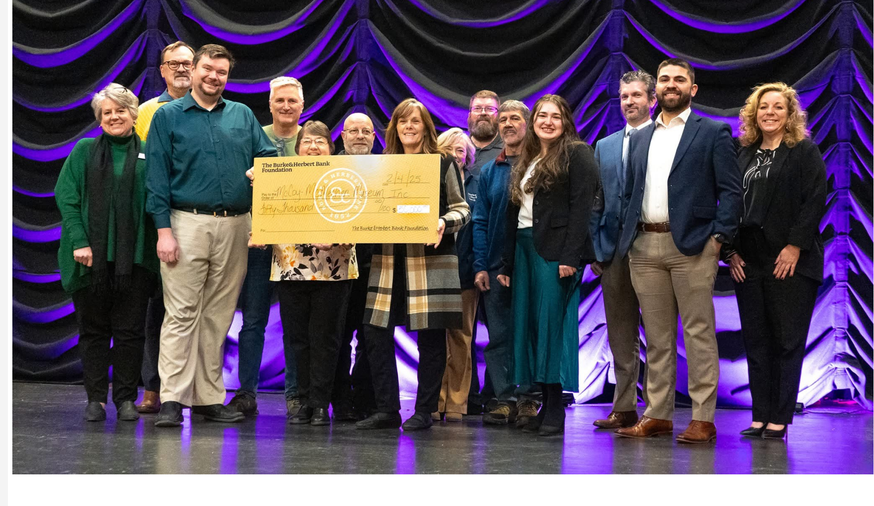
Members of the Burke and Herbert Foundation along with Board Members of McCoy's Grand celebrate the $50,000.00 grant.

McCoy's Grand has embarked on a new capital campaign - CURTAIN UP! LIGHT THE LIGHTS! to replace the existing lighting and sound equipment in the theatre. The current lighting instruments are over 30 years old and we can't even find replacement bulbs. The sound equipment is over 25 years old as well. The new campaign is underway with plans to make the new upgrades in August 2025. Working with Pittsburgh Stage, the new lighting and sound will be state of the art LED technology that will help increase productions as well as technical times at the theatre. McCoy's recently was awarded a $50,000.00 check from the Burke & Herbert Foundation toward our $250,000.00 goal. We've raised $120,000.00 so far toward our goal and look forward to completing the project in September. To learn more about the campaign email - mccoysgrand@icloud.com .