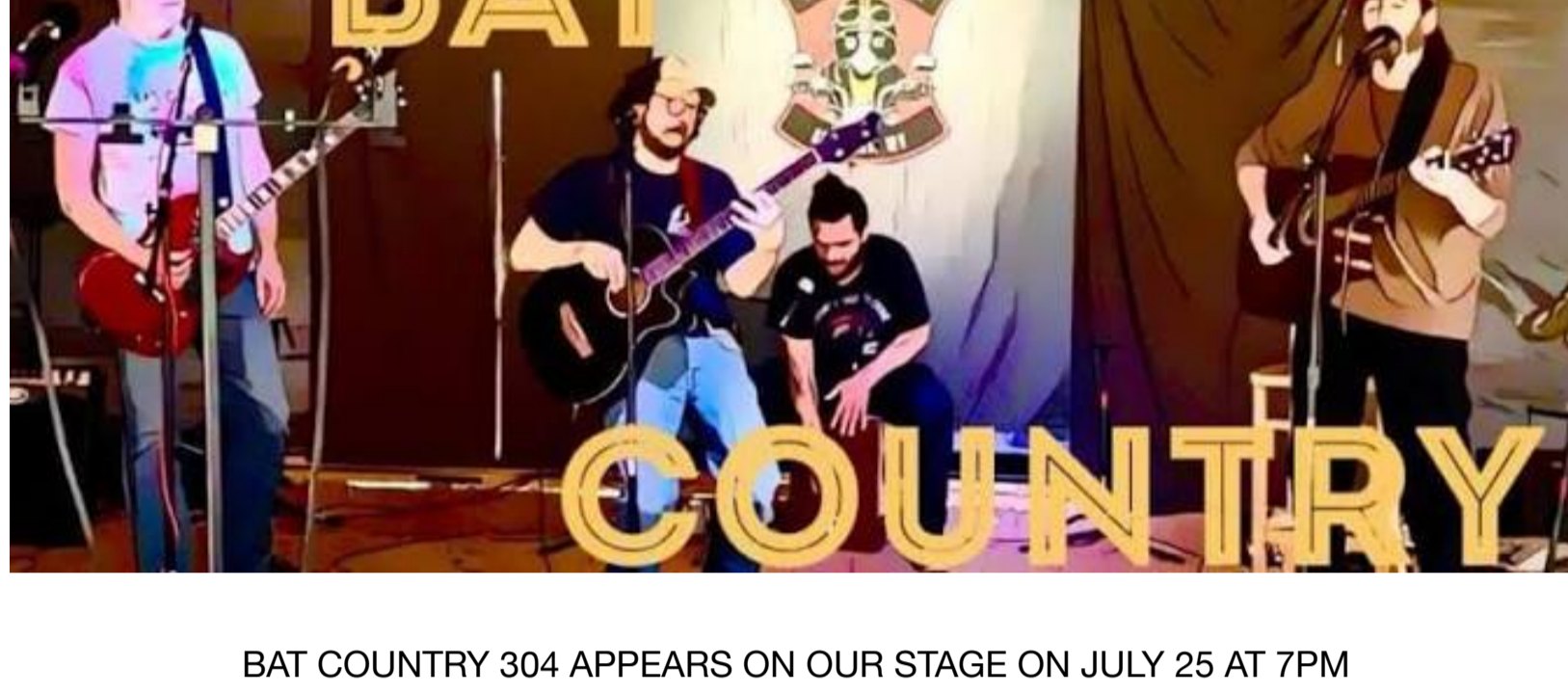
BAT COUNTRY 304 APPEARS ON OUR STAGE ON JULY 25 AT 7PM

These concerts are part of McCoy's Grand's continued commitment to creating affordable community entertainment and bringing people together through live music in the new Courtyard Plaza & Gardens.