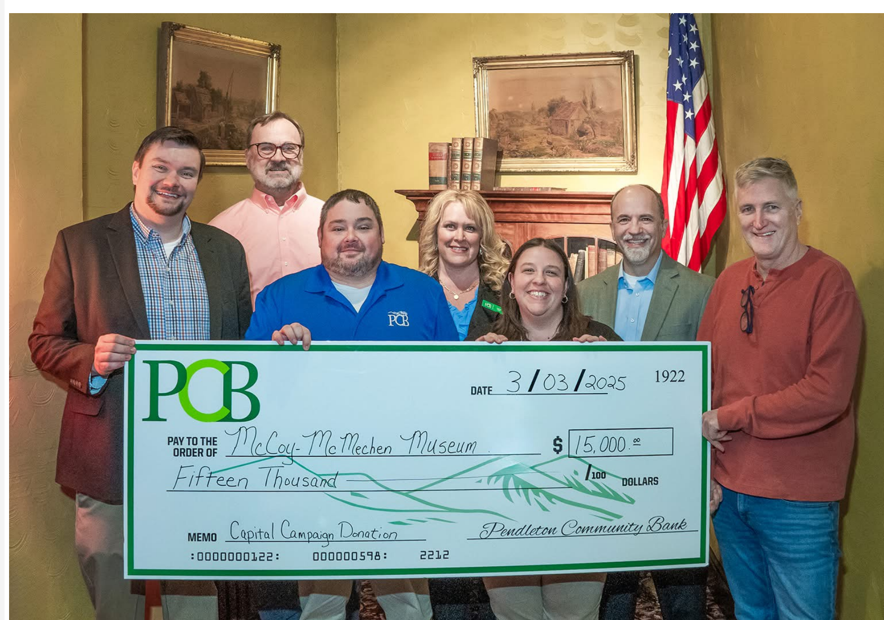
Members of PCB along with Board Members of McCoy's Grand celebrate the $15,000.00 grant.

In October, McCoy's Grand embarked on a capital campaign - CURTAIN UP! LIGHT THE LIGHTS! to replace the existing lighting and sound equipment in the theatre. The current lighting instruments are over 30 years old and we can't even find replacement bulbs. The sound equipment is over 25 years old as well. The new campaign is underway with plans to make the new upgrades in August 2025. Working with Pittsburgh Stage, the new lighting and sound will be state of the art LED technology that will help increase productions as well as technical times at the theatre. McCoy's recently was awarded a $15,000.00 check from the PCB toward our $250,000.00 goal. We've raised $143,500.00 so far toward our goal and look forward to completing the project in September. To learn more about the campaign email - mccoysgrand@icloud.com .