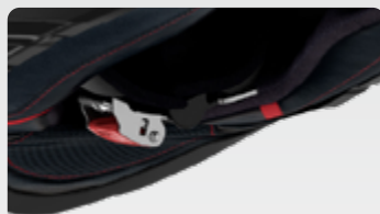
TWO-TONE INTERIOR & RED STITCHING