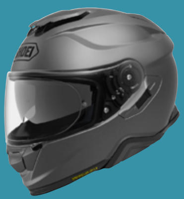
MATTE DEEP GREY