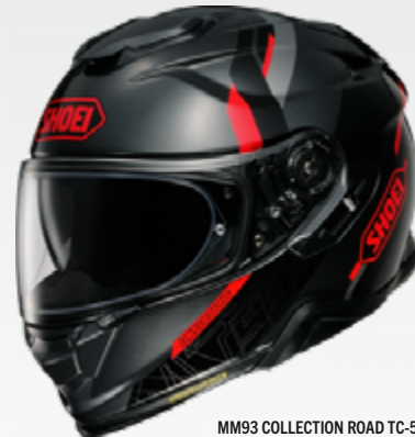
MM93 COLLECTION ROAD TC-5