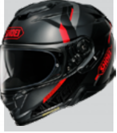
MM93 COLLECTION ROAD TC-5