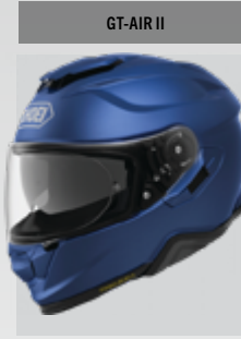
MATTE BLUE METALLIC