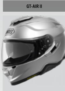
BLACK LIGHT SILVER