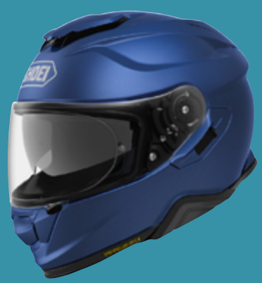
MATTE BLUE METALLIC