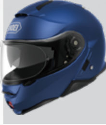
MATTE BLUE METALLIC