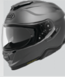
MATTE DEEP GREY