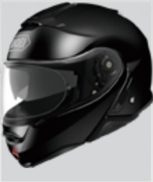
NEOTEC II BLACK