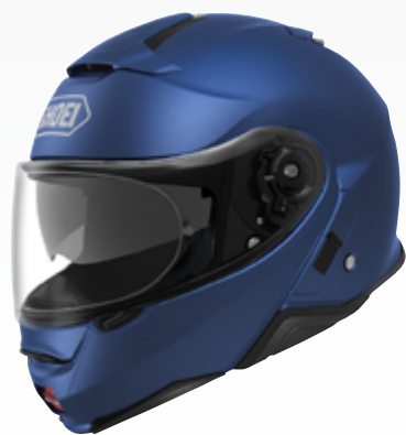
MATTE BLUE METALLIC