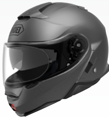
MATTE DEEP GREY