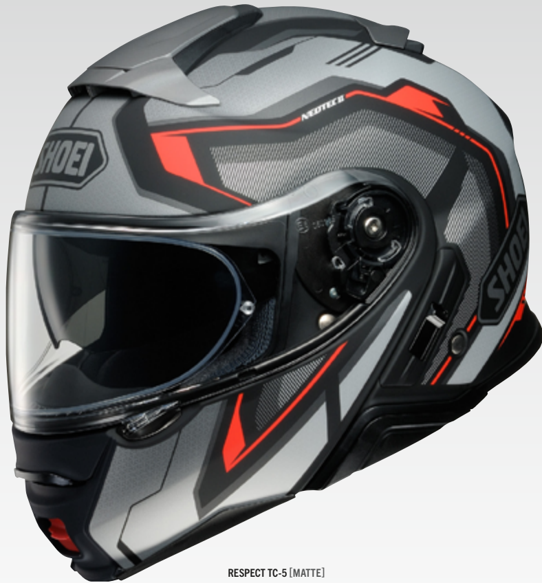
RESPECT TC-5 [MATTE]