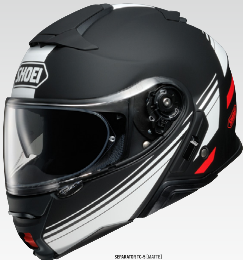
SEPARATOR TC-5 [MATTE]