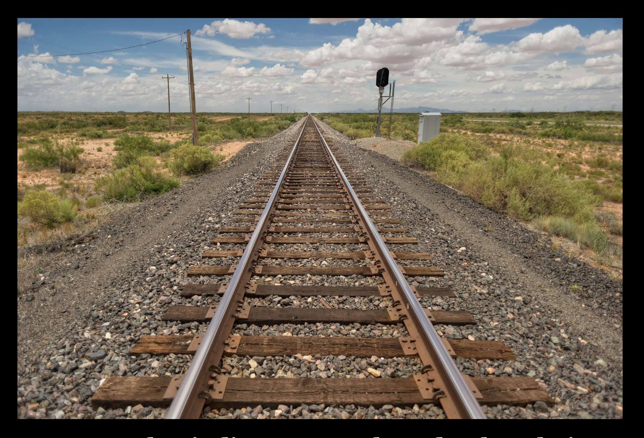
Next Week: Finding Your Style and Color Choices