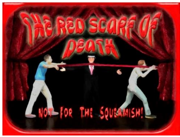
June Online Video Library Addition

Here's a quick impromptu magic trick that works particularly effectively when you just so happen to be wearing a scarf. It appears quite realistically that after wrapping the scarf around your neck, it unexplainably melts through your neck even after making a knot and pulling on the ends.