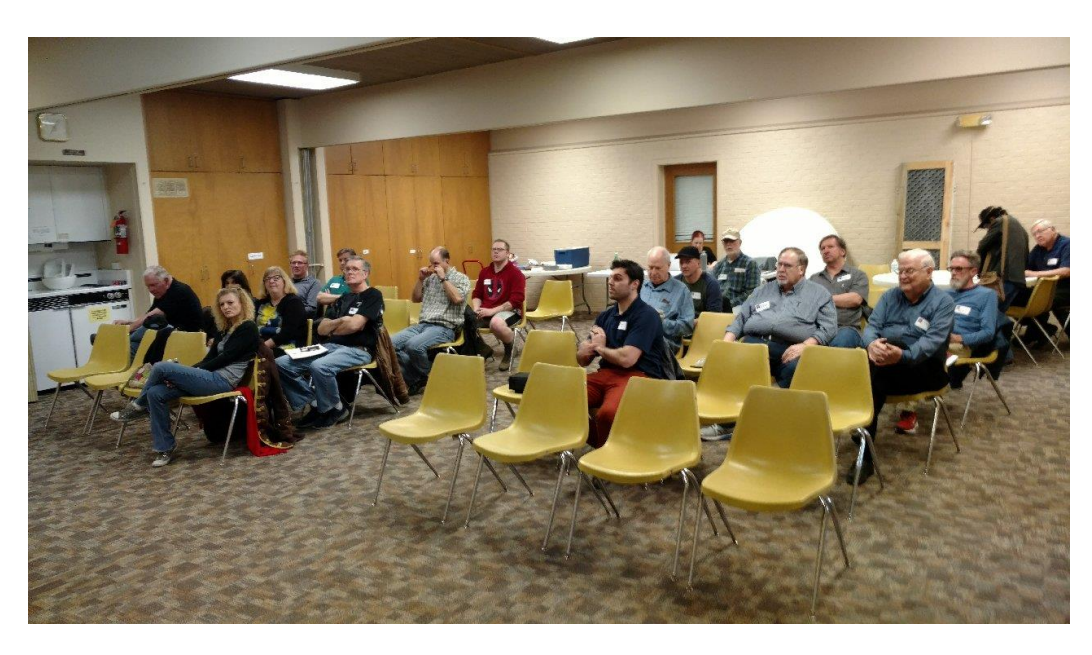
Another atentive gathering