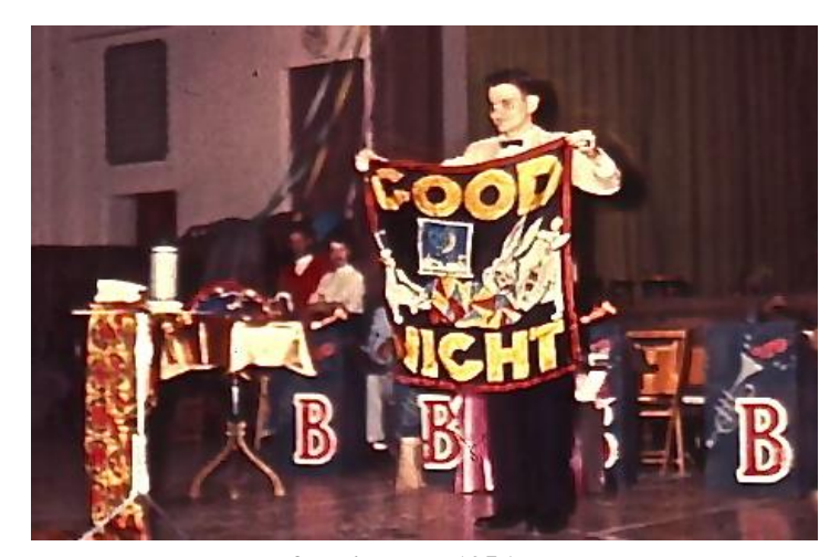
Tom performing at a 1956 Dance Party

for physics combined with magic principles. The four decades old tradition consists of 30 stations which showcase different physics phenomena. Zepf puts it best himself in an article published in the Physics Teachers Journal early in 2000, "Halloween celebrates a frightful, irrational confrontation with mystery, whereas in physics we approach the mysteries of the universe rationally." But words cannot describe the Haunted Lab sufficiently. As an added feature this month, if you go to our website https://theomahamagicalsocieity.org you will find a link to a short video WOWT TV did on the lab some years back and an abbreviated video tour of the lab.