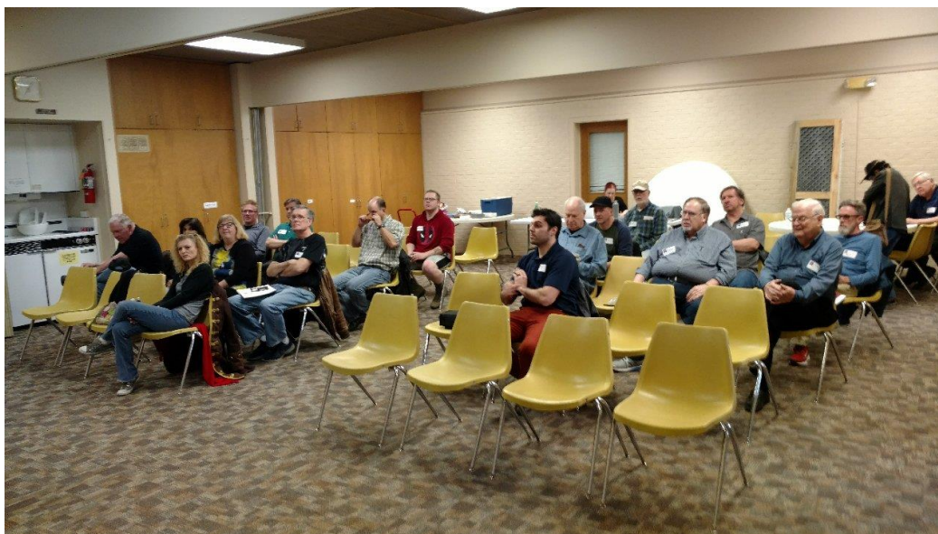
Another attentive gathering