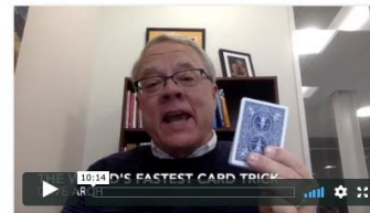
Fastest Card Trick (Easy/Close-Up/Pl...