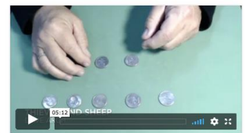
Thieves and Sheep (Easy/Close-Up)