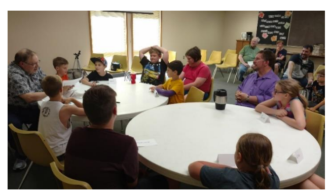
The S.Y.M. kids