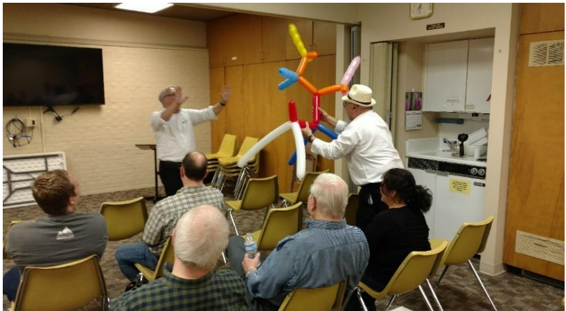
Friday Lunches Club Activities