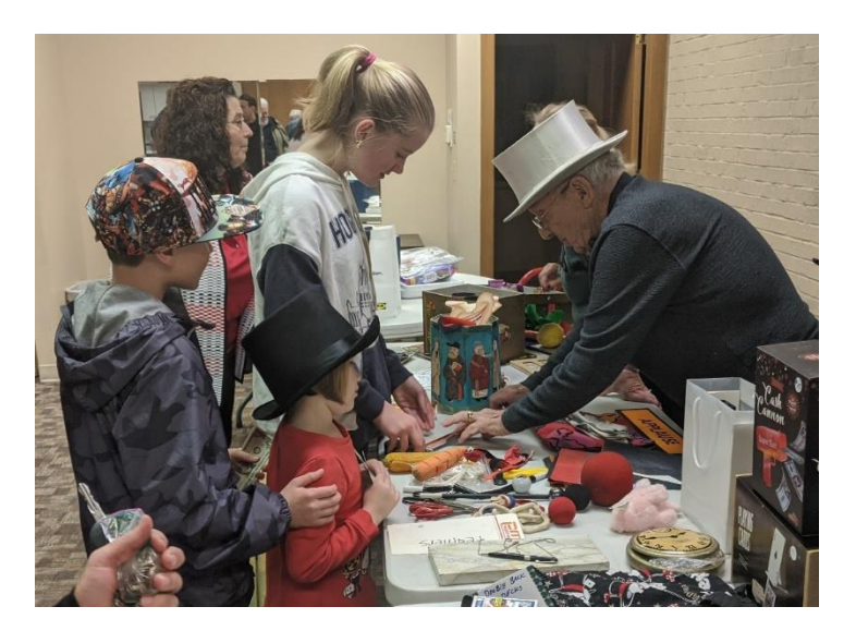
Tax Deductible Magic Tricks Donation

If you're a member and haven't yet been given entrance to the Facebook page, please reach out through the yellow button off to the right and we'll correct the situation. If you aren't a member, you can remedy that yourself by clicking on this link: <u>https://theomahamagicalsociety.org/membership</u> and paying your $20 dues for 2021 online now.