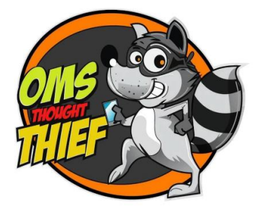
A Holiday Gift for You