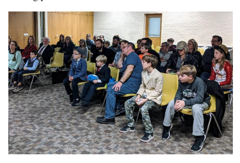
A Spellbound Audience

amazement for parents, friends, relatives and some of our members at large. We look forward to seeing the wonderful things they will develop and perform in the coming years.