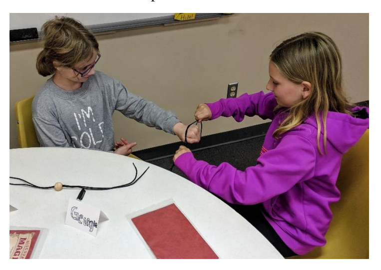
Quite often we look at magic only as entertainment, but it can be edu-tainment as well.

Young people come to us through many avenues; grandparents, other SYM members, teachers who know that one of their students is in the group, a cousin, a neighbor, a friend of the family, magicians they've seen who invited them to become involved, parents searching the internet, and many more. But somewhere along the line it comes down to personal contact.