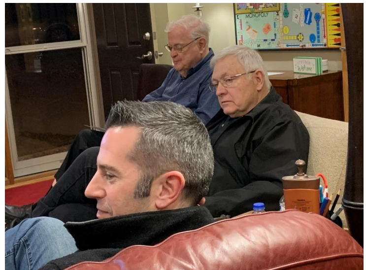
An evening to remember filled with creative conversation and collaboration.