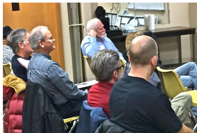
Attentive audience.