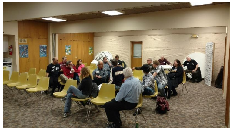
Our ethical questions discussion.