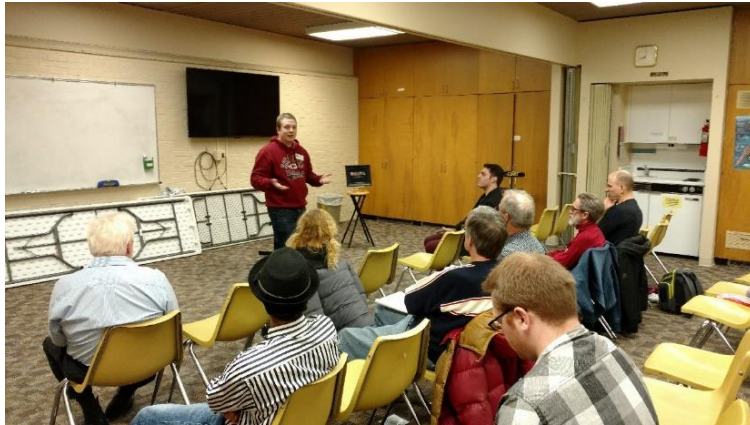
Theron and his stamp collection.

David Fox led things off with a wonderful talk on mentalism that involved billet switches. He showed several different methods to switch one billet for another and treated us to a great routine in the process.