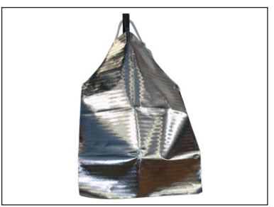
Aluminized Protective Wear Prod.# CE CP 340