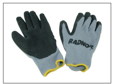
Cotton Poly Latex Coated Palm Gloves Prod.# CE CP 342