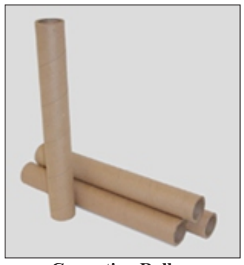
Cremation Rollers Prod.# CE CP 218-60 Case of 60 Size: 2 3/8" Dia. x 18" Long