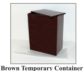
Prod.# CD HHH 260 Size: 8 3/4" H x 7" W x 4 ½" D Volume: 260 cu. in. Packed 12 per case, Minimum order 1 case.