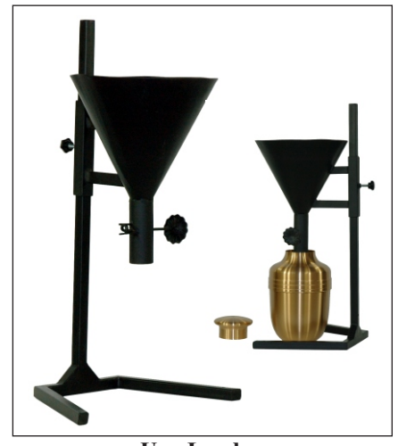
Urn Loader Prod.# CC CP 9998

Use this adjustable loading funnel to easily transfer cremated remains into an urn for final disposition. Loading height is adjustable and features stopper on the funnel neck.