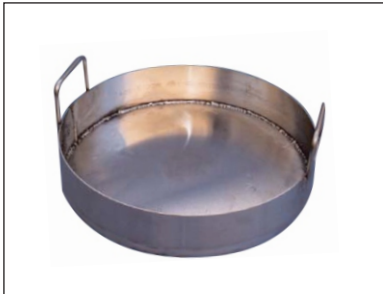
Infant Cremation Pan Prod.# CE CP 315

Move caskets with ease. Professional look with dual usage, utility or display. Durable steel framework with a powder coat finish. 5" casters make for easy handling.