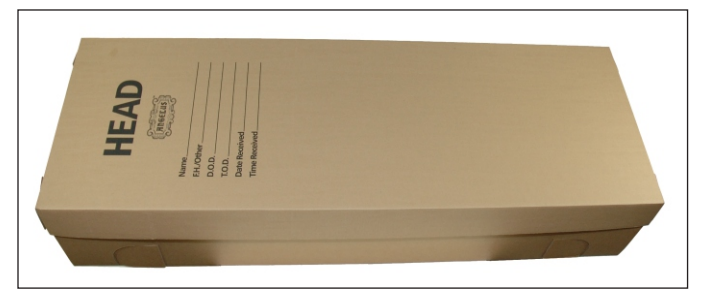
Cremation Container Prod.# CE CP 2010 <u>TOP</u> Prod.# CE CP 2050 <u>BOTTOM</u>