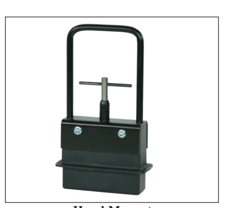
Hand Magnet Prod.# CE CP 310

The heavy duty brush allows you to sweep your cremation chamber with less abrasion to it's surface, increasing the life of the refractory. (poles not included, ½" standard pipe thread).