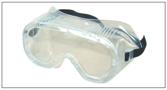
Standard Goggles Prod.# CE CP 320