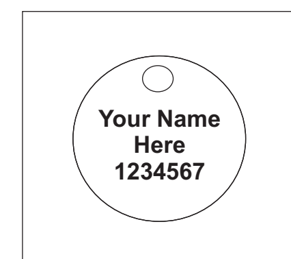
Identification Discs Prod.# CE CP 114

Stainless Steel with one hole Includes 1- 4 Lines of Type and 1 Line of Sequential Numbering No Setup Charge Size: 1 1/4" Diameter 18 gauge 1/4" Hole for attachment