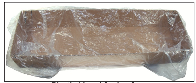
Plastic Liner / Casket Cover Prod.# CEP 200000