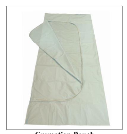
Cremation Pouch Prod.# CEP 04046 White Polyethylene vinyl acetate pouch, Curved zipper 10 mil thickness. Safe for cremation. Contains no PVC. Size: 40" W x 96" H

Stainless Steel with one hole Includes 1- 4 Lines of Type and 1 Line of Sequential Numbering No Setup Charge Size: 1 1/4" Diameter 18 gauge 1/4" Hole for attachment