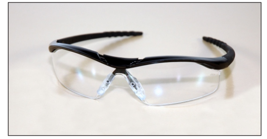
Lightweight Eyewear Prod.# CE CP 322