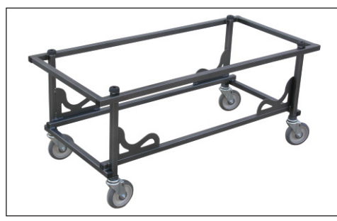
Casket Truck Prod.# CE LM CT 400

Move caskets with ease. Professional look with dual usage, utility or display. Durable steel framework with a powder coat finish. 5" casters make for easy handling.