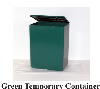
Prod.# CE TCC-2 Textured Kelly Green Polypropylene 8 5/16" H x 6 3/8" W x 4 ½" D Volume: 200 cu. in. Packed 36 per case, Minimum order 1 case.