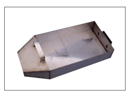
Transfer Pan Prod.# CE CP 318

The infant cremation pan is made of 12 gauge stainless steel and equipped with handles on each side for easy positioning, the pan's compact size allows it to fit in every type of cremation chamber.