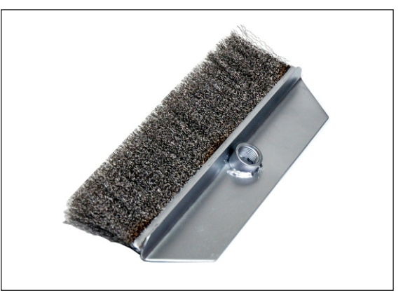
12" Clean-out Strip Brush Prod.# CE CP 7560-12SS

Use this adjustable loading funnel to easily transfer cremated remains into an urn for final disposition. Loading height is adjustable and features stopper on the funnel neck.