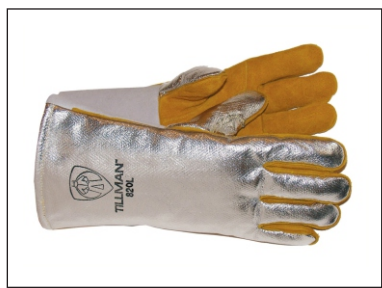
Aluminized Welding Gloves Prod.# CE CP 345