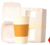
NO Foam Cups & Containers NO vasos y recipientes de poliestireno