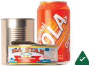
Food & Beverage Cans Latas de alimentos y bebidas