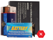
NO Batteries Check local drop-off programs for proper disposal NO baterías - Verifique los programas locales de entrega para su correcta eliminación