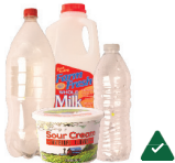
Plastic Bottles & Containers Botellas y envases de plástico