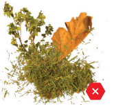
NO Green Waste NO desechos verdes