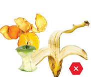
NO Food or Liquids NO comida o líquidos

Do Not Include In Your Recycling Container No Incluir En Su Contenedor De Reciclaje