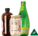
Glass Bottles & Containers Botellas y envases de vidrio