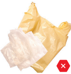
NO Loose Plastic Bags, Bagged Recyclables or Film Empty recyclables directly into your cart NO bolsas y envolturas de plástico sueltas, o materiales reciclables embolsados. Vacíé directamente los materiales reciclables en nuestro carrito