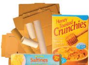
Flattened Cardboard & Paperboard Cartón y cartulina aplastados