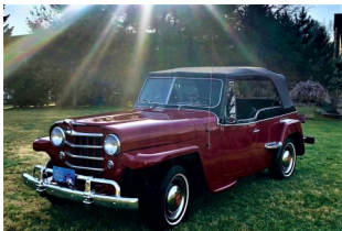
Miss January 2023