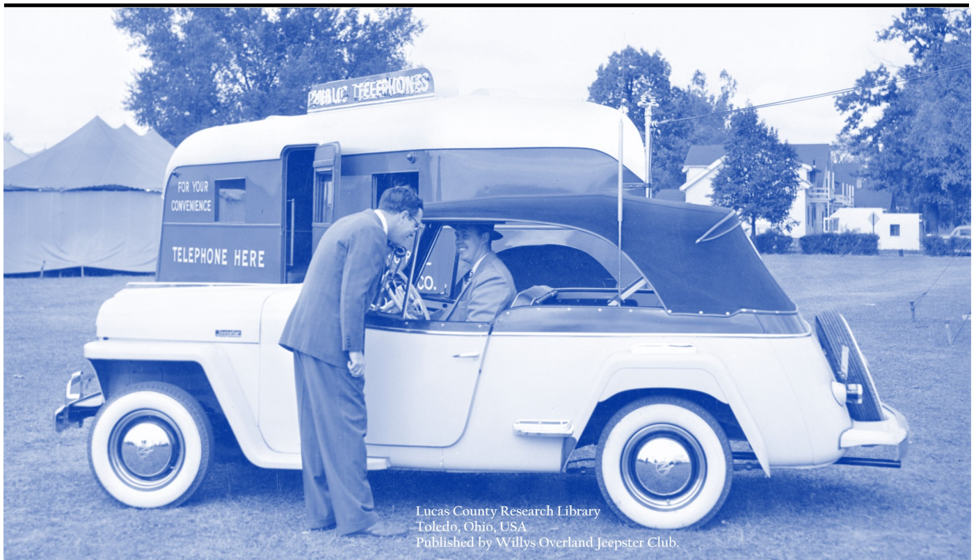
Lucas County Research Library Toledo, Ohio, USA Published by Willys Overland Jeepster Club.

LOOKING BACK: Willys rolled out their new model 'Jeepster' in 1948 and along with it a strong advertising campaign intended to bring all the attention possible to the car. This is an example of a factory promotional photo shot at a state fair no doubt somewhere in the American heartland. Note the businessman behind the wheel and the interesting antenna mounted in the rear.