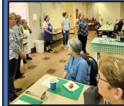
Mid-week Lenten Soup & Service 3-11-2026