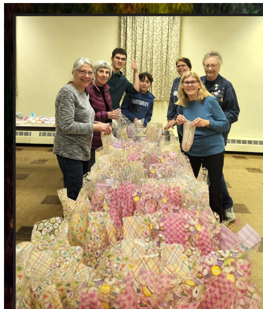
Easter Basket Mission Project