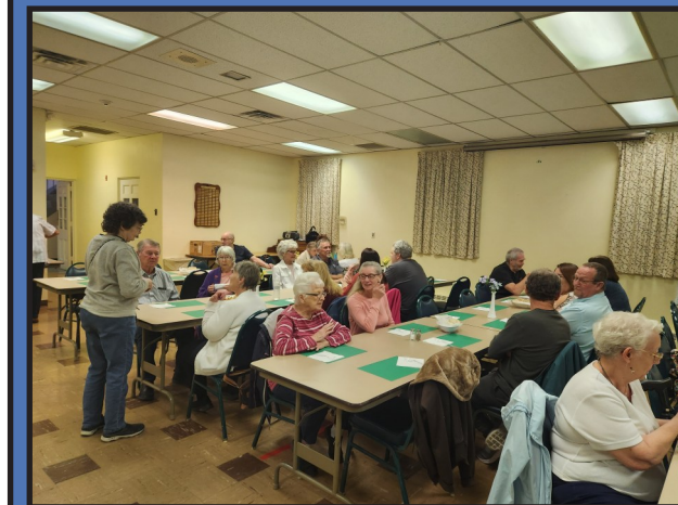
"Welcome Spring" Fellowship Hour 3-22-26