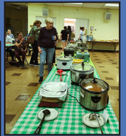
Thank you to everyone who provided soup & bread. Also, thank you to the kitchen crew for set-up and clean-up.