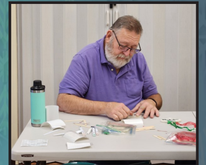
Longest Night Service at Lower Saucon UCC