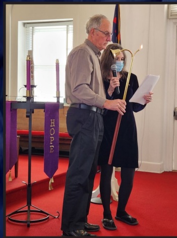
Lighting the Candle of Hope