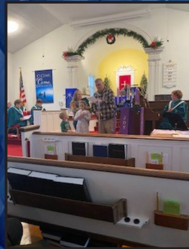
Lighting the Candle of Joy