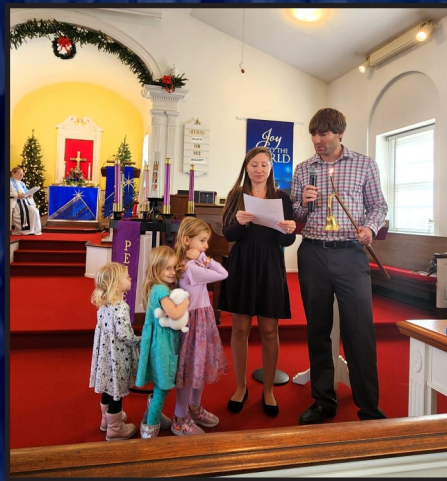
Lighting the Candle of Peace