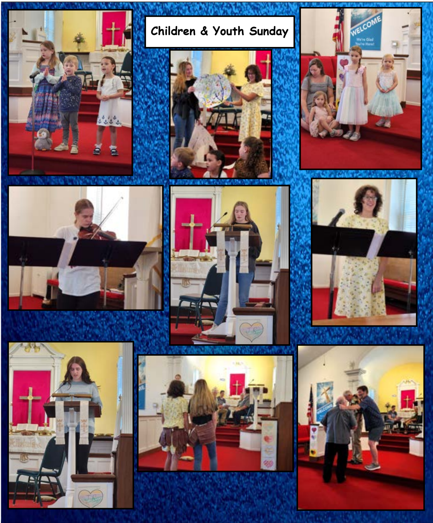
Children & Youth Sunday