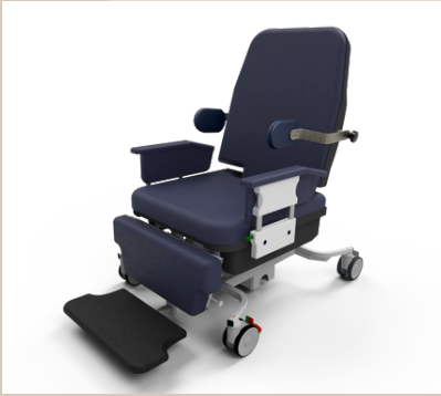
With optional lateral support

Ideal for patients needing thoracic or trunk support