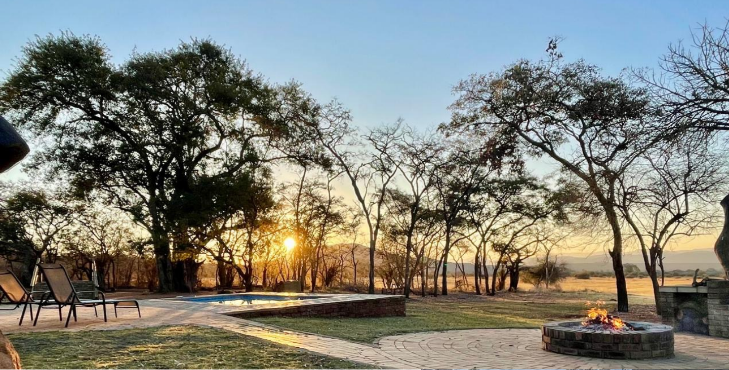
Table tennis to entertain both young and old is conveniently placed in the loft with a dartboard. The private swimming pool offers welcome relief on hot summer days.

Modjadji Camp only a few km's away offers a variety of fun activities for children such as a jungle gym, putt-putt course, table tennis and a swimming pool. Delicious light meals like burgers and pizzas can be ordered for your convenience.